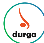
Durga Sugar Pvt Ltd