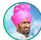
Sadashivrao Mandlik SSK Ltd.